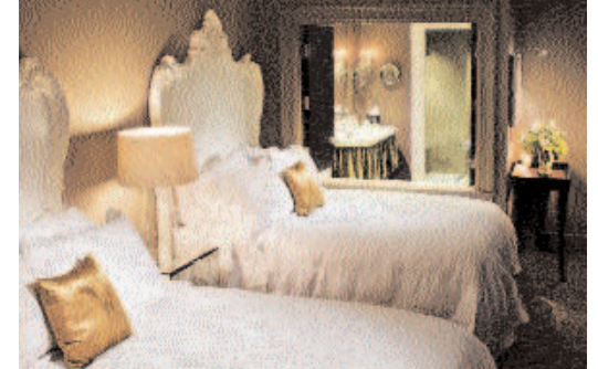
Left to right: A Bohemian suite in the Mansion on Forsyth Park; The Bösendorfer Lounge